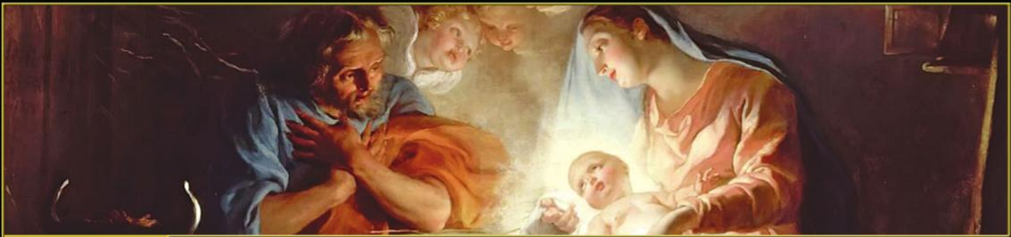
Nativity (1730) - Noel-Nicolas Coypell III

...blessed is the fruit of your womb. Lk 1:42