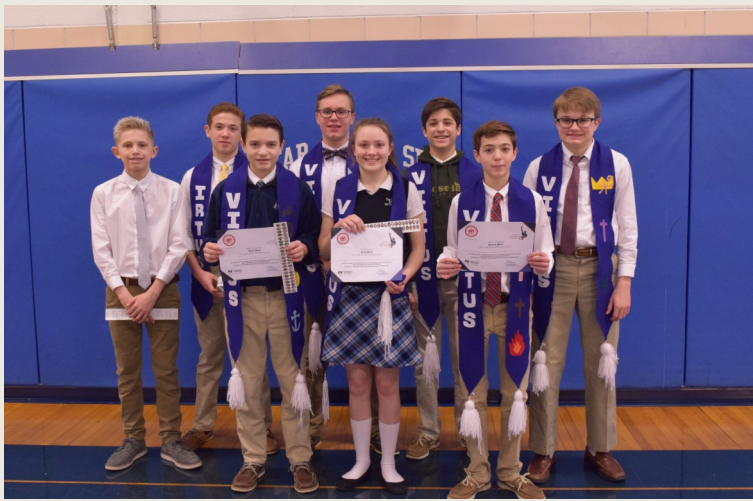
"America and Me" Essay Contest Winners