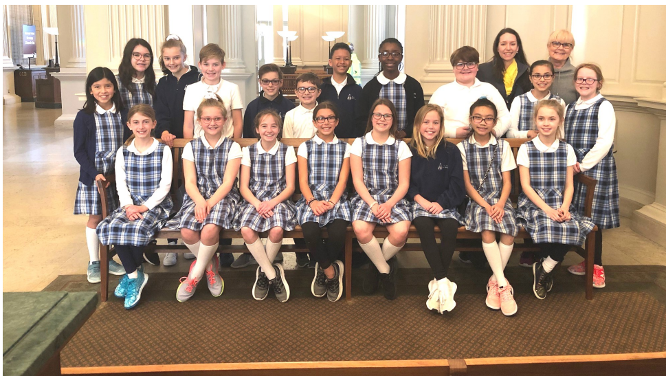
Our fifth grade went to The Henry Ford Museum to enhance our social studies curriculum