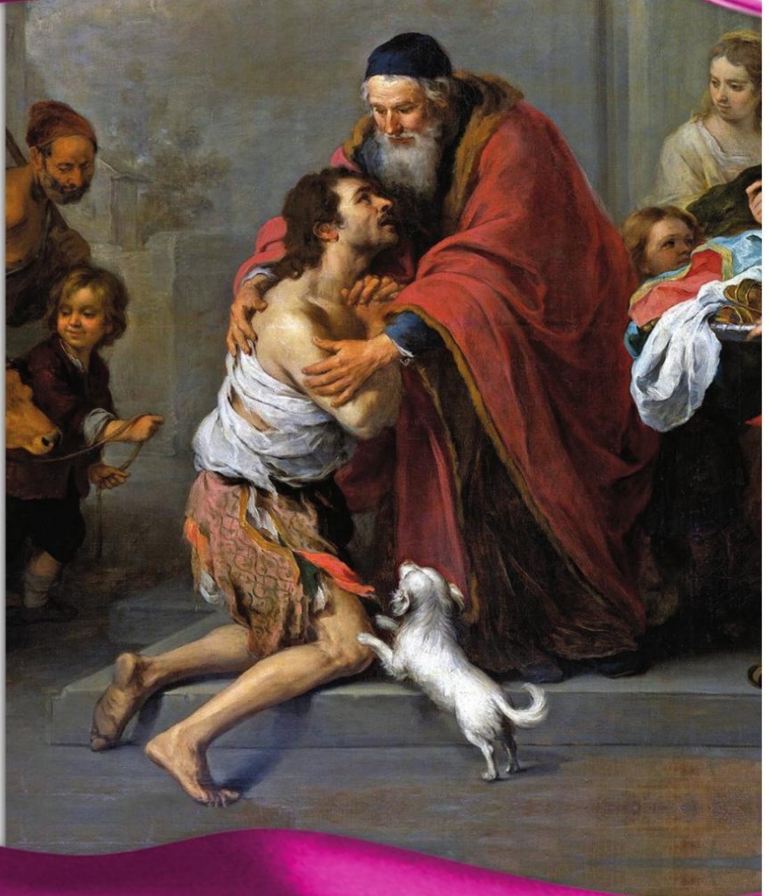
The Return of the Prodigal Son by Barolomé Esteban Murillo, circa 1670