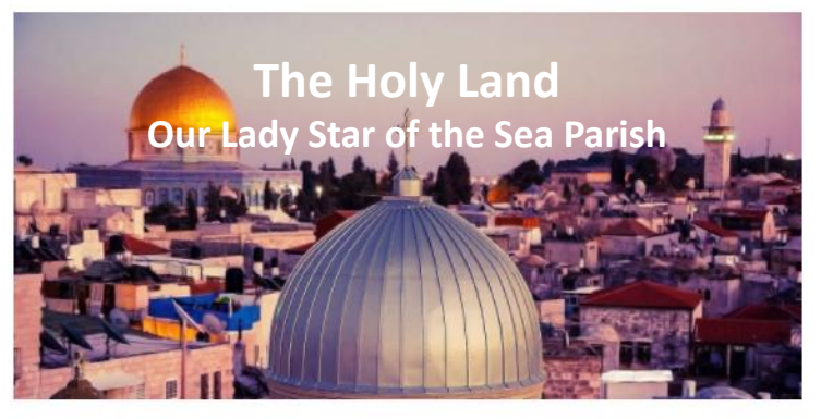
February 19-28, 2024 Questions?

Consider coming to the chapel or church to show your love for our Lord. Enjoy the peace only He can give.